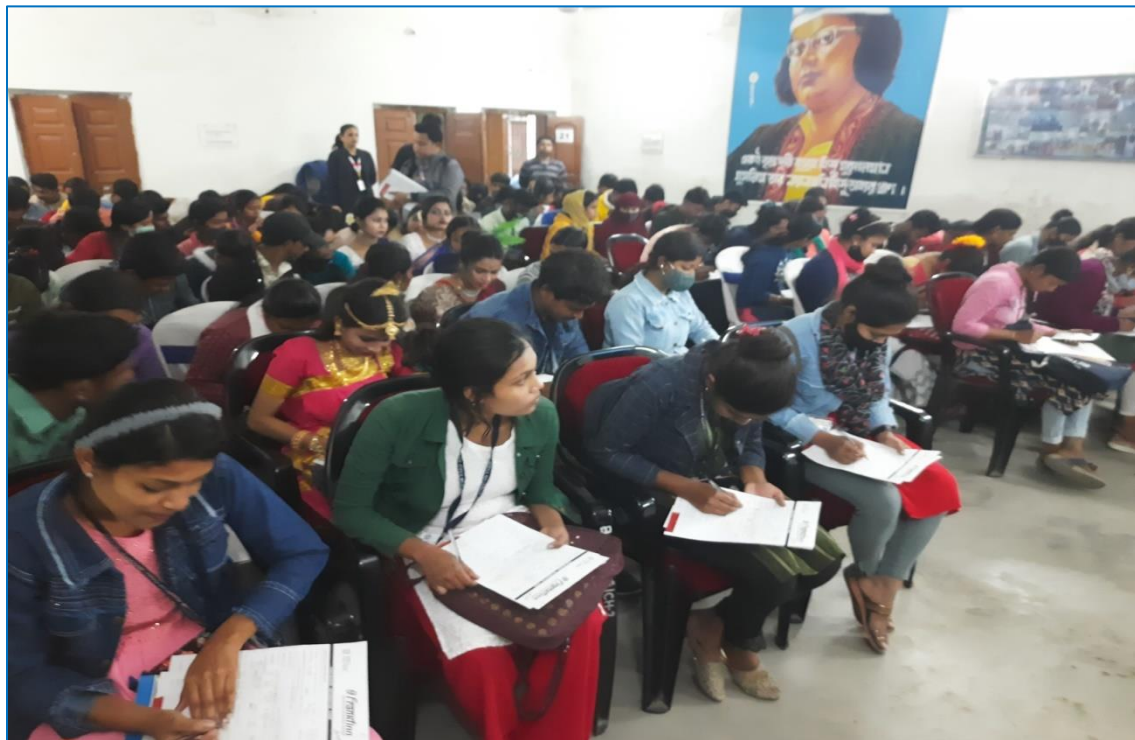
Students were attending the training nicely