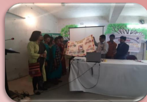
Phoenix-Editor S.C Deptof Education