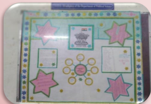
Civitus- mouth piece ofDept of Pol.Sc