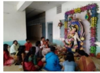
Saraswatipuja organized by B.H.K.M.