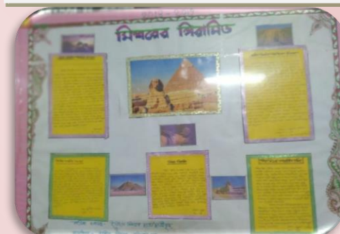
Wall magazine of Dept of History

A wall magazine is a beautiful medium of student's expression. Our college is fortunate enough because different departments publish their wall magazines where students display their artistic works.