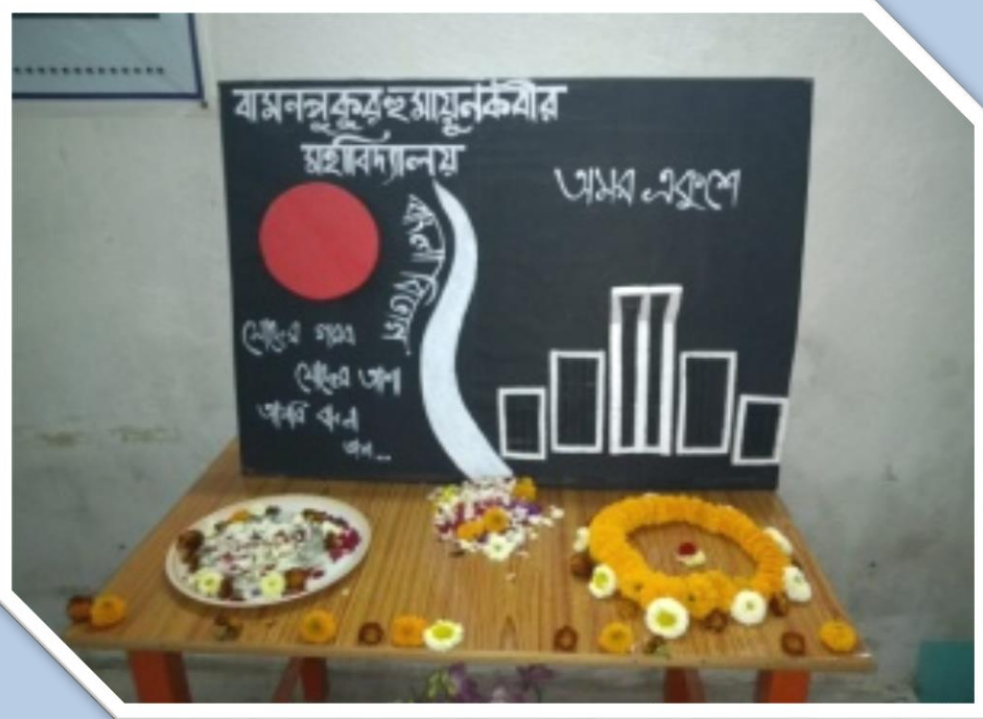
Logo of Bhasha Divas made by the students of the Department of Bengali Hons. on Bhasha Divas [21 st February]