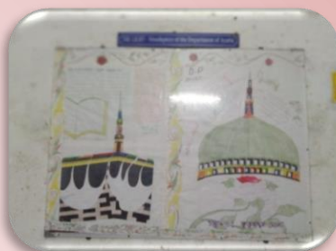
Wall magazine of Dept of Arabic